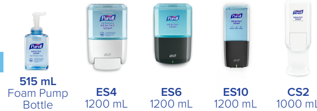
515 mL Foam Pump Bottle ES4 1200 mL ES6 1200 mL ES10 1200 mL CS2 1000 mL

Push-Style Touch-Free (4 C Batteries) Touch-Free (Energy-on-the-Refill) Push-Style