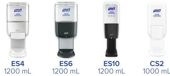
ES4 1200 mL ES6 1200 mL ES10 1200 mL CS2 1000 mL

Push-Style Touch-Free (4 C Batteries) Touch-Free (Energy-on-the-Refill) Push-Style